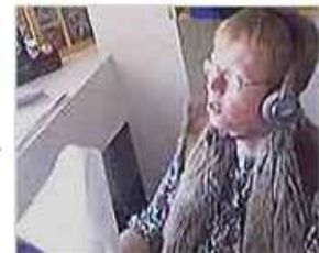
Figure 4: Transcript data corresponding to audio and video data recorded from the remote observation exercise for the Excel spreadsheet

The upper left-hand corner of the figure shows the practice question whilst the upper right-hand corner shows the Excel spreadsheet that both the researcher and the student can see. Below this, a transcript of the student's utterance is shown along with the timeline in the experimental period. The actions of the student are also noted after the experiment. These actions, such as the clicking and entering of data, can be seen from watching the screen capture video, whilst the actions such as reading printed materials are noted through the webcam video. A webcam picture of a student reading printed materials is shown to the side of the transcript. In this particular episode, we note that in this practice question the student is looking at the black-box spreadsheet and there seems to be some confusion as to what to do. The data shows that from time 14:17 upon entering the black-box calculator spreadsheet, the student decides to read back