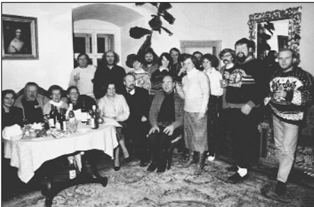
The participants of the 1992 conference in Niedzica Castle.