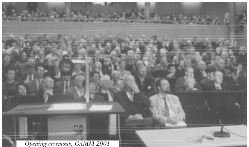
Opening ceremony, GAMM 2001